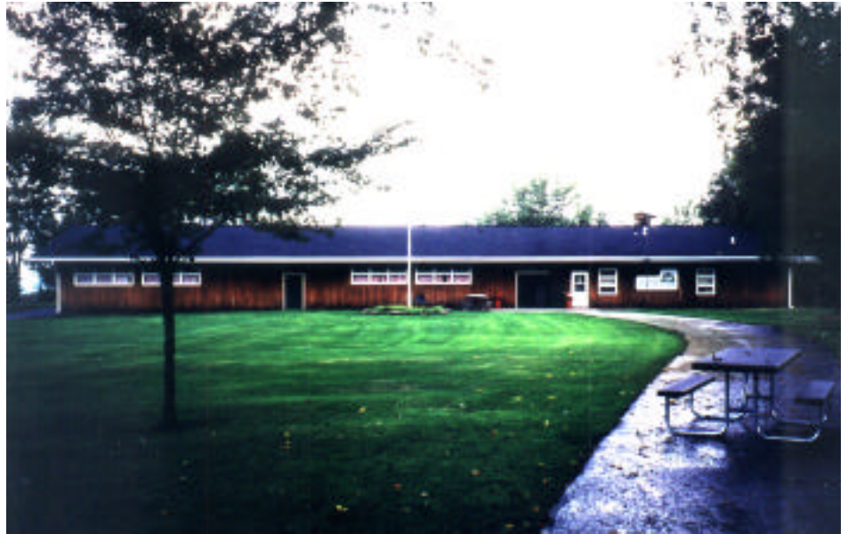
The main lodge building of Wisconsin Badger Camp. Bunks, showers, kitchen, and dining area are all located in this building.

We will need many more signs. Ben Cimino has made 4 signs that we can use on the gravel roads. If you work with wood, we could use some big wooden glow-in-the-dark signs and