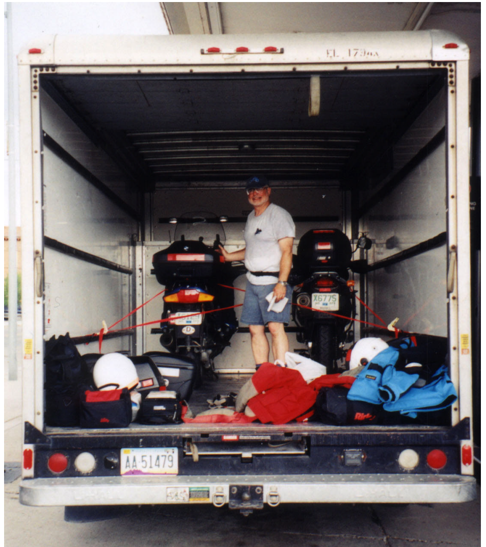
The last U-Haul truck available in Hardin, WY. Another adventure in moving about to begin.

A call to U-Haul and we were even more lucky to find a truck available. I rode the F650 downtown, filled out the paperwork, and left a charge card deposit. As we returned with both bikes and gear, our luck continued as we found this was their last truck and someone else called for one just after we reserved it.