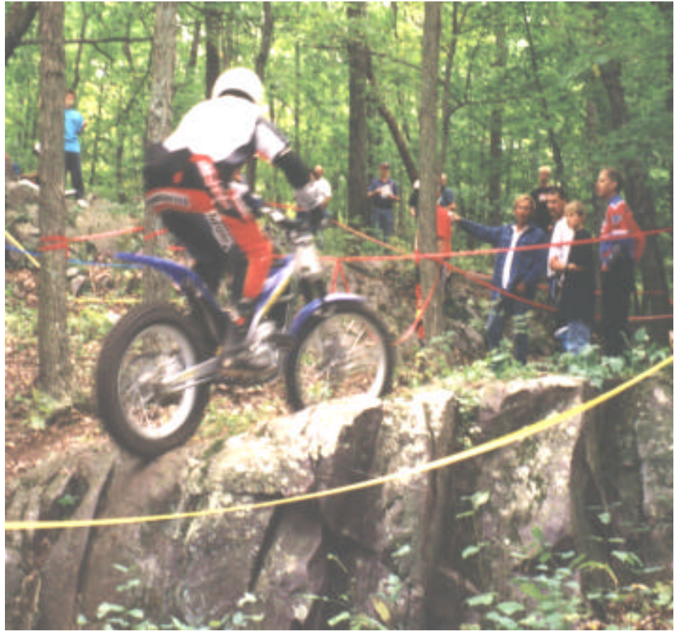
Another fun day was enjoyed by all who watched the rock hounds of the Midwest Observed Trials in the Baraboo Bluffs in late September.

About 20 miles out of Bathurst the road suddenly went from good pavement to something