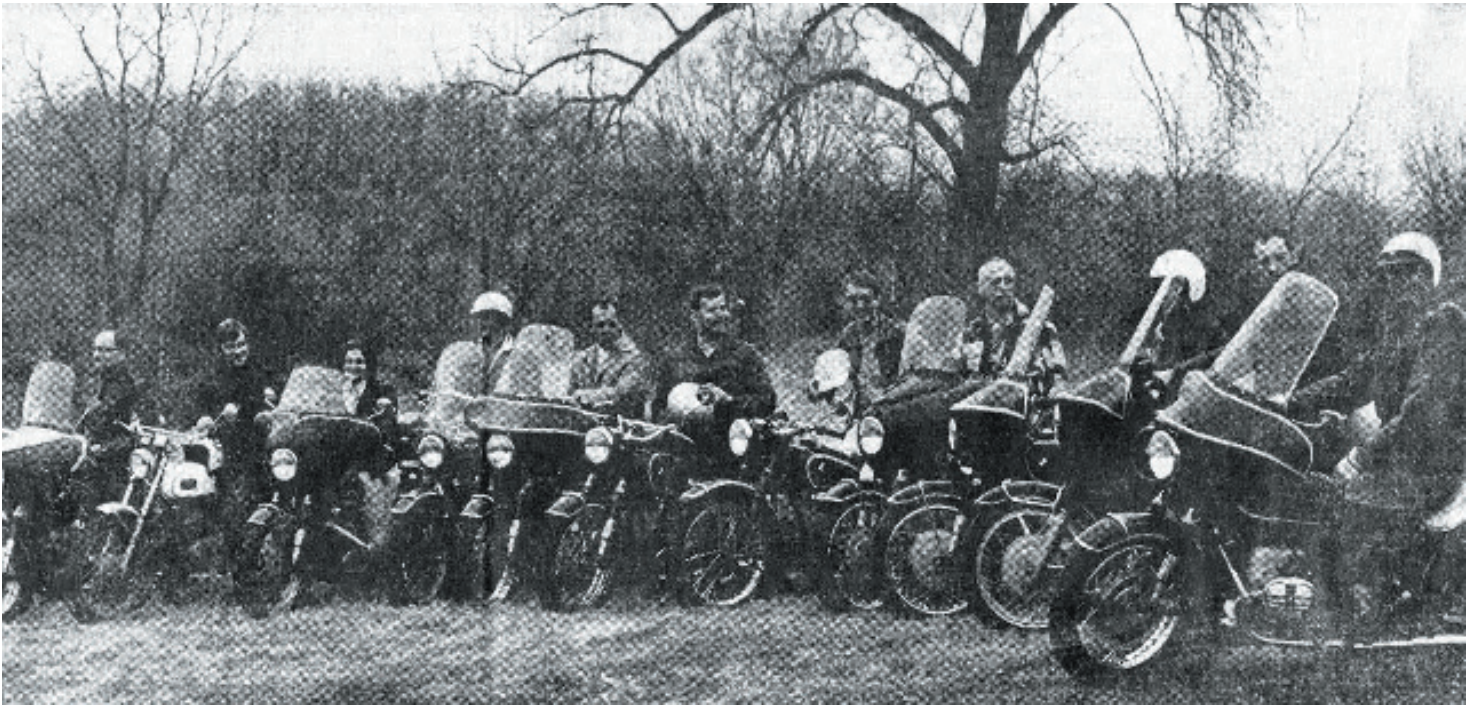
Photo taken March 1968 (the year after the founding of the club) and published with an article in the Capital Times: