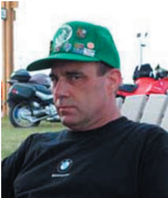
Generalissimo Presidente for Life