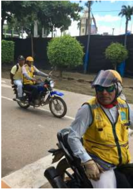
Motorcycle Taxi last February in

I'd estimate that 80% of the vehicles in this rain forest city were either small motorcycles or 3 wheeled taxis all 300 cc or smaller. It was so much fun to see, that I took a test ride on a 310 GS at Mischlers when I got home. Sticking with my 1200 cc ride for now!