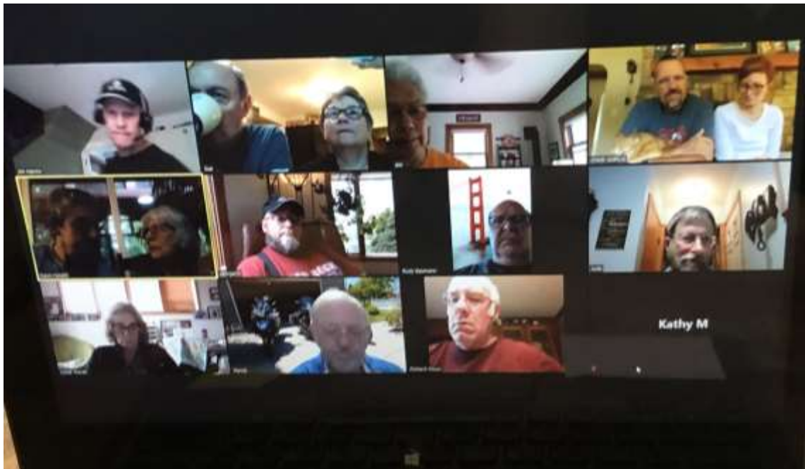
The face(s) of a Club meeting a la 2020.