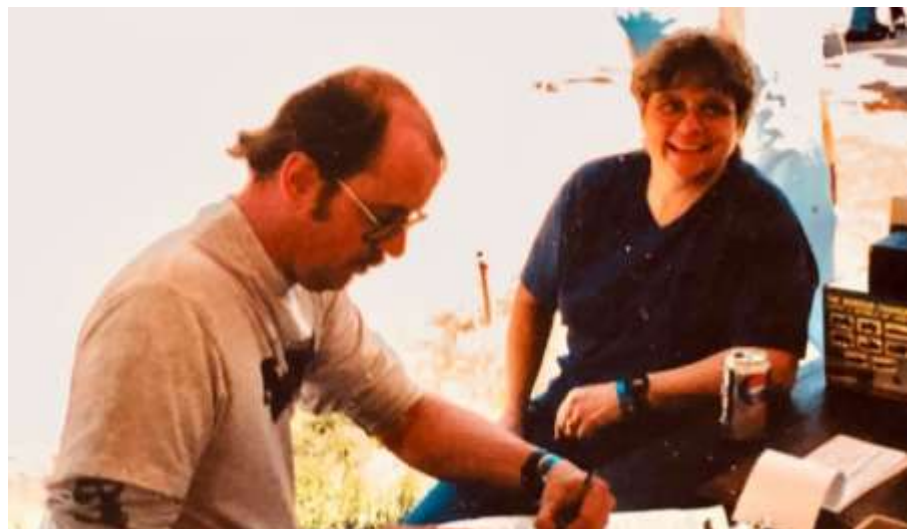
A long-ago GR/3...