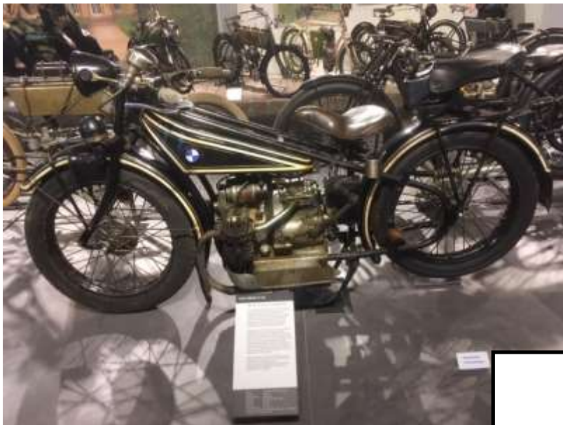
An early-20s R32 in a museum in Neckarsulm

SELF-EMPLOYED: I'm not talking to myself. I'm in a staff meeting.