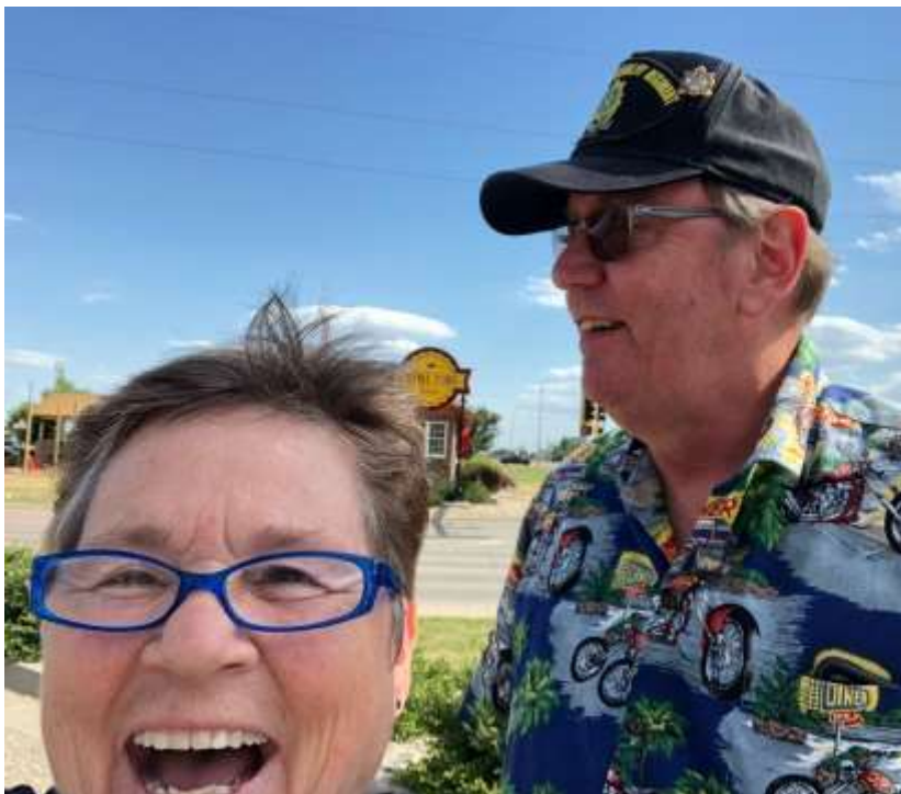
At a steak joint in Huron, SD

You can never make the same mistake twice - because the second time you make it, it's not a mistake, it's a choice.