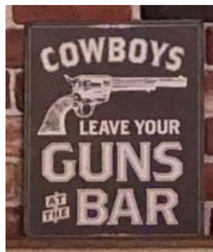
Somewhere in Montana.