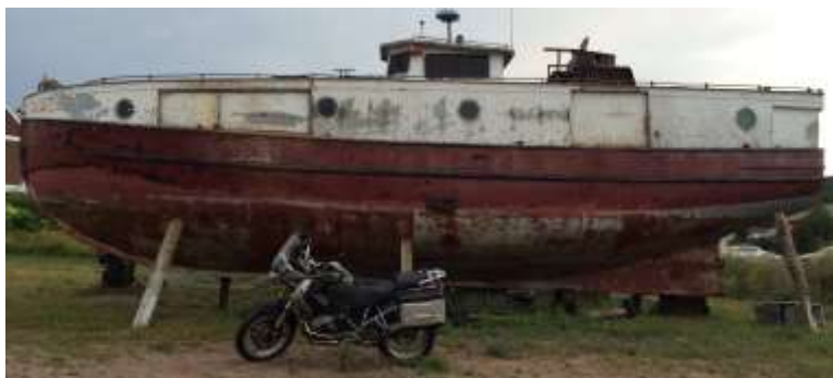
Bayfield, WI

http://www.wiscdellyclub.com/index.php?option=com_virtuemart&Itemid=154