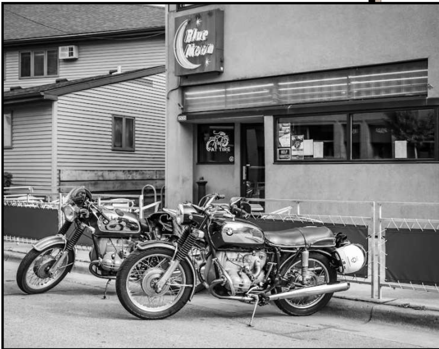
Two Slash 5s at a local landmark.

CLUB PICNIC IS AUGUST 1st—BRIGHAM PARK (BLUE MOUNDS) AT NOON