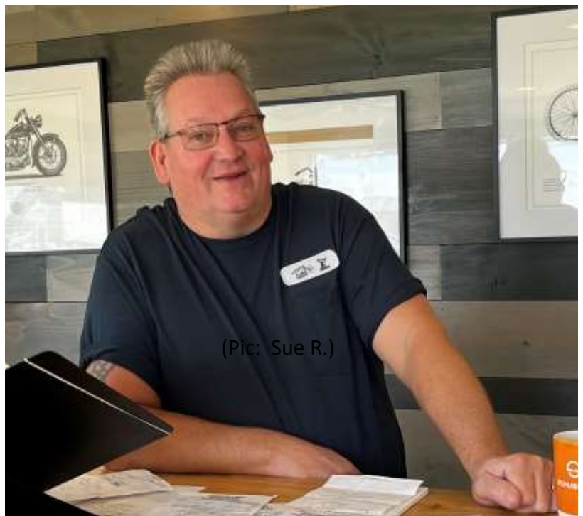
(Pic: Sue R.)