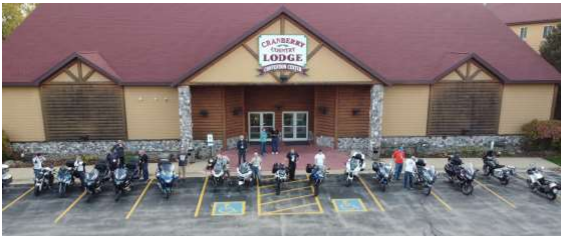
A few of the Tomah Getaway attendees.