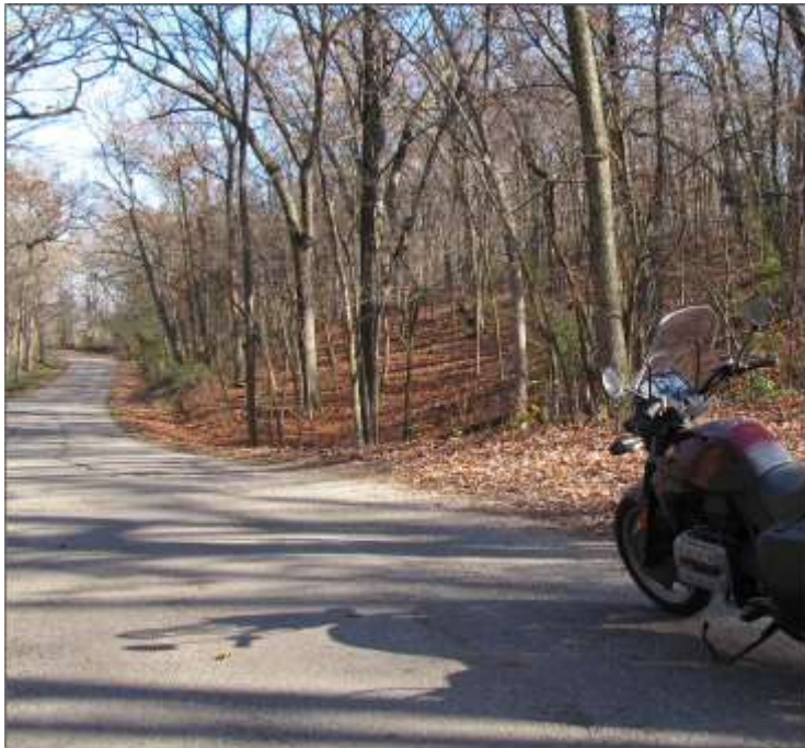
Sue's K75 on a back road.