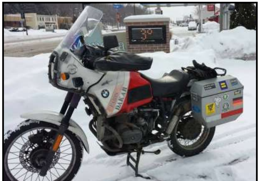
Corrine J's tried-&-true rig...