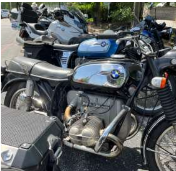
Slash 5s in Missouri