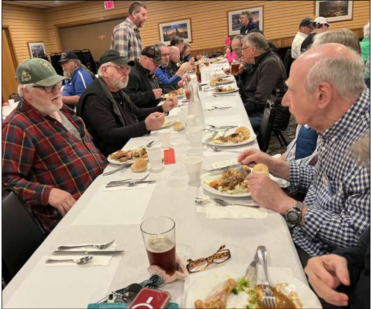
Wild Goose Run 2023.