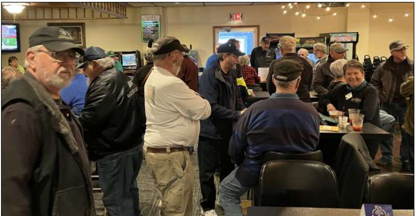
Goose Run.