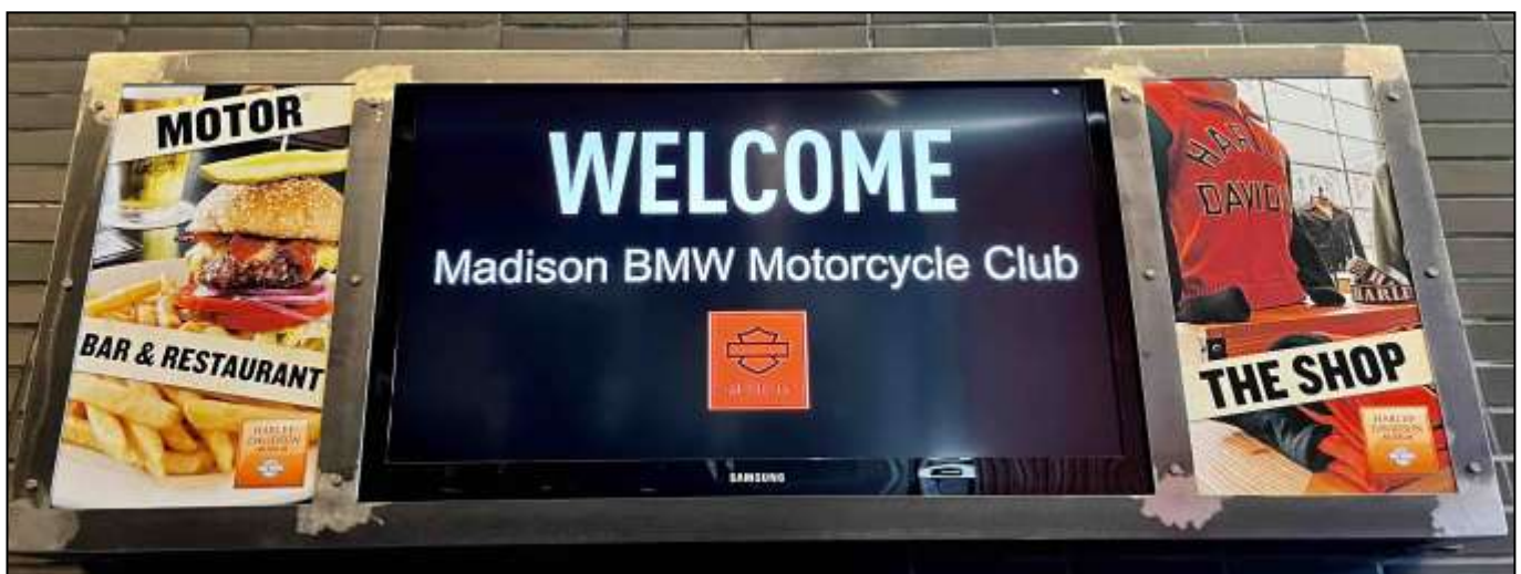
A welcome to the Harley museum.